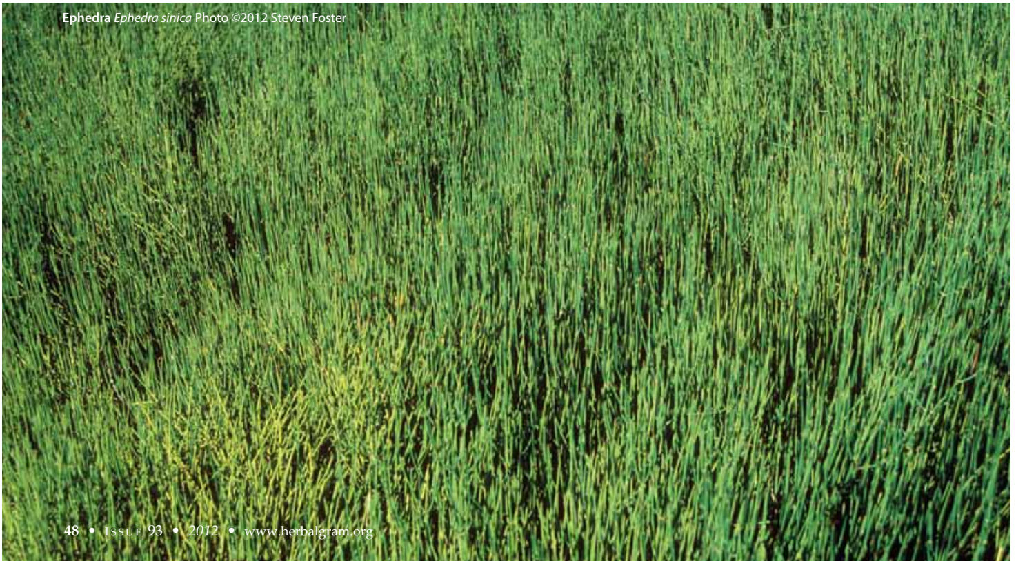
Ephedra Ephedra sinica

‡‡‡In the preamble to the final rule, FDA clarified its position as follows: "The Government's burden of proof for 'unreasonable risk' [under Section 402(ff) of the FDCA] is met when a product's risks outweigh its benefits in light of the claims and directions for use in the product's labeling or, if the labeling is silent, under ordinary conditions of use.] Some in the dietary supplement industry have argued that FDA acted improperly in applying the risk/benefit standard, in part, because application of the risk/benefit standard itself was not subject to notice and comment rulemaking and public input.