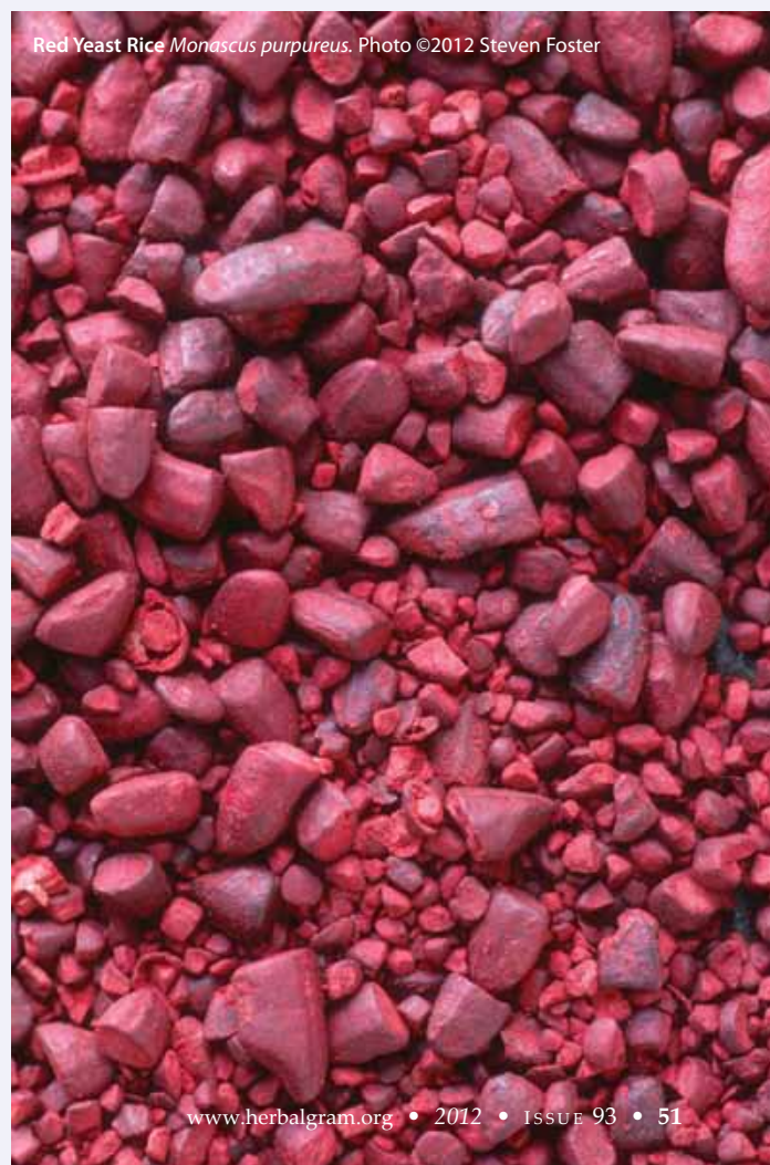
Red Yeast Rice Monascus purpureus .

Other non-governmental organizations also are engaged in assisting dietary supplement manufacturers and ingredient suppliers in complying with FDA’s GMP regulations and ensuring product quality. NSF International—an independent nonprofit organization founded in 1944 to standardize food sanitation and safety requirements, develop public health standards, and certify products—administers its third-party certi-